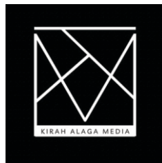
KIRAH ALAGA MEDIA