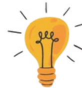
EASY POWER POWER MADE EASY.